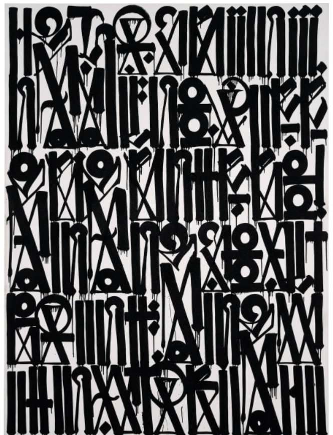
He is a criminal no different from me, RETNA